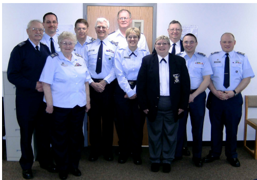
CLC 2010 graduating class