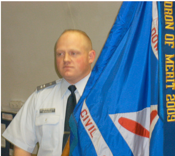
Captain Bearscope